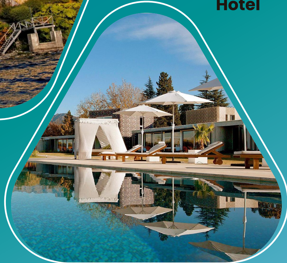
Entre Cielos Hotel