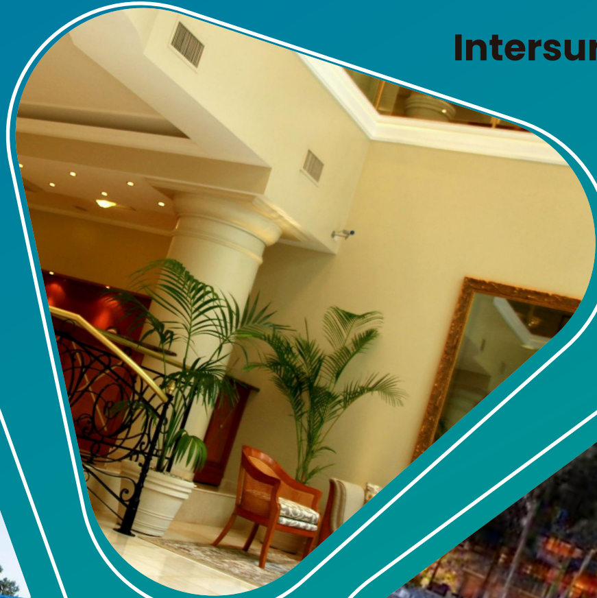
Intersur Recoleta Hotel