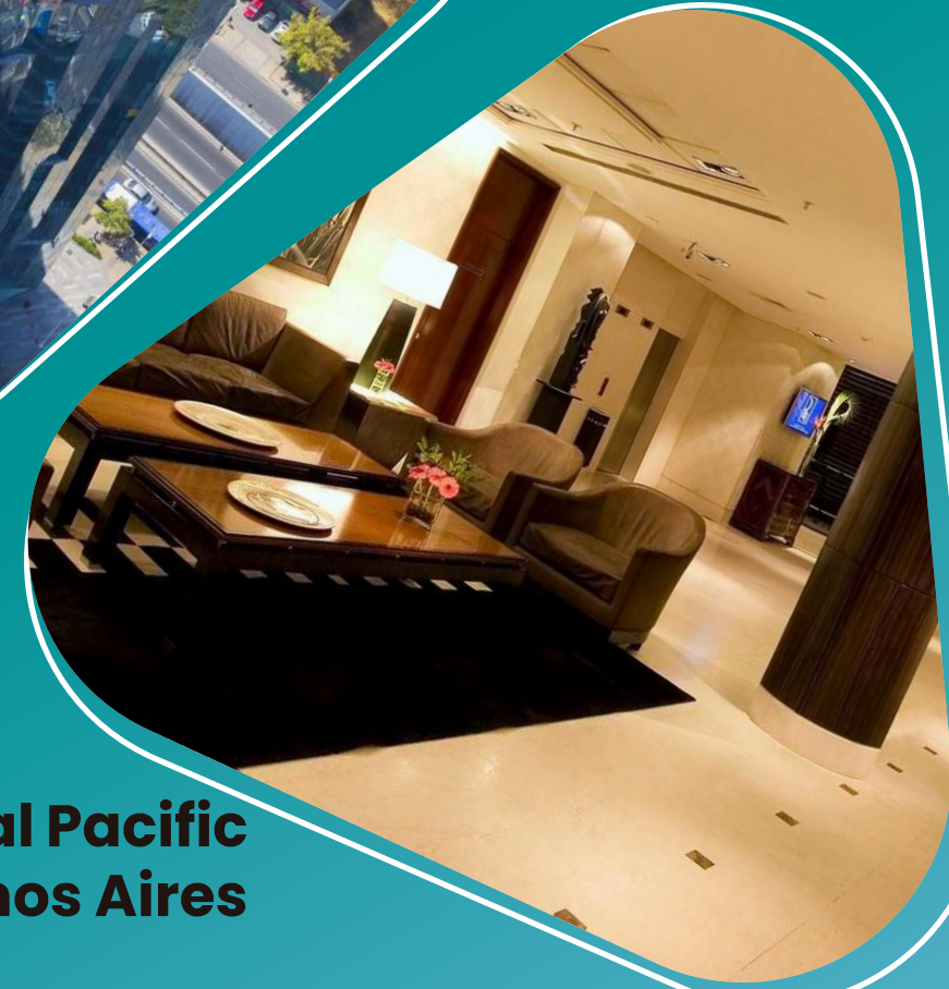
Regal Pacific Buenos Aires