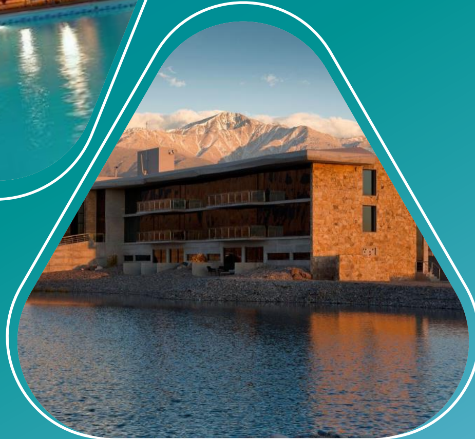
Casa de Uco