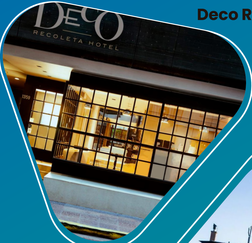
Deco Recoleta Hotel