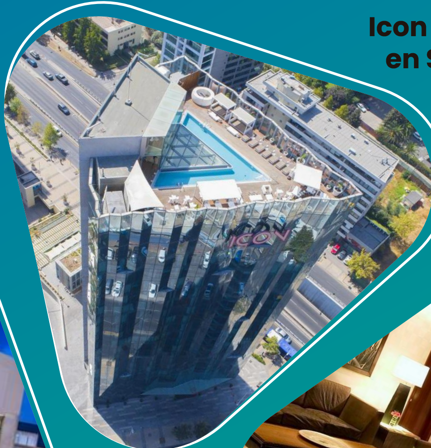
Icon Hotel en Santiago de Chile