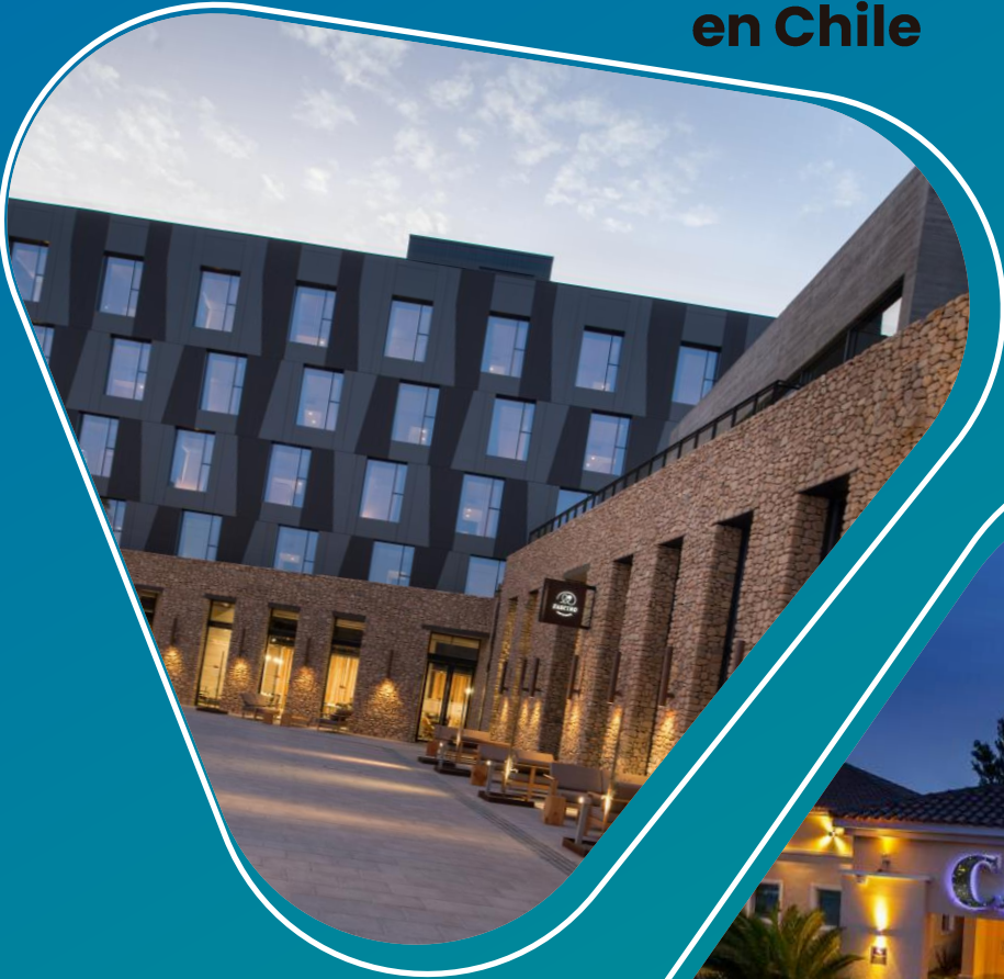
Keo Hotel – Ovalle Casino Resort en Chile